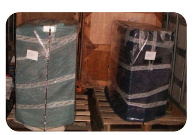
Uncrated, even if skidded