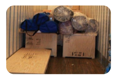
Carpet & Padding (shipped "loose")